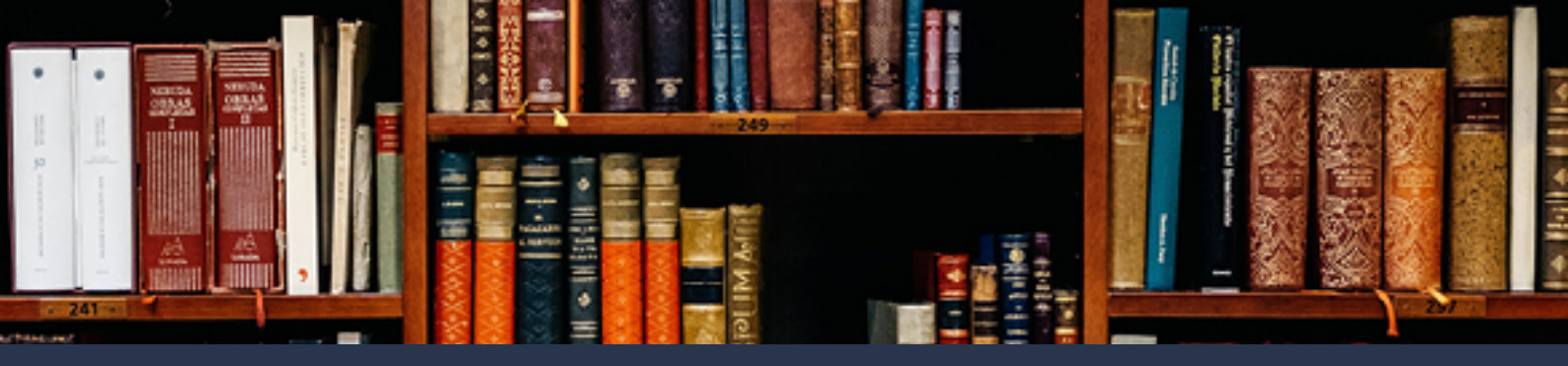
April 2023 e-periodical issue 15